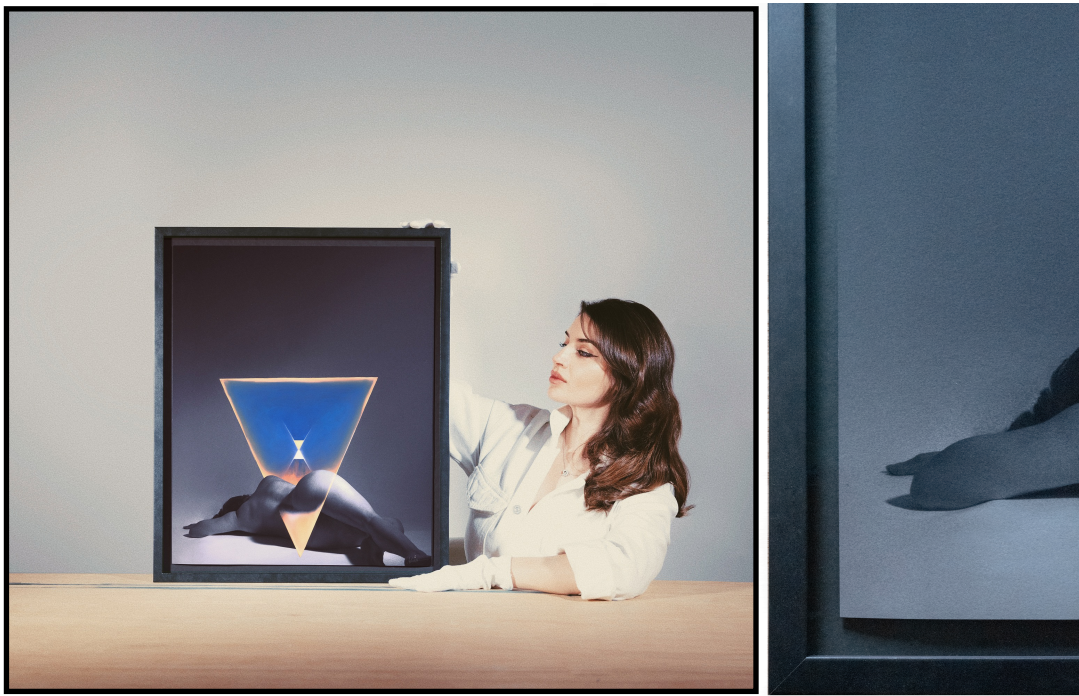
No. 6- to demonstrate scale of piece and show frame.

Ayla highlights this transformative state associated for each stage within the series, labeled No. 1-7 respectively. Merging several artistic techniques—from photography and pencil drawing to digital and physical painting—each artwork is accentuated with the application of exclusively 24-carat gold and premium silver pigments. Although presented in a digital format, 'The Seven' includes works on paper featuring a solitary female figure in monochrome. This stark contrast brilliantly highlights the colored symbol of each alchemical stage within the represented triangle. (The inverted triangle symbolizes water within the practice of Alchemy.) This collection emanates from a deep fascination with alchemy. From Calcination's symbolic destruction of the ego to Coagulation's transcendence of dualities, each piece invites the viewer into a reflective exploration of both personal and universal transformation.